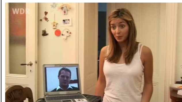
A picture of Julie's ex-boyfriend is on the laptop.