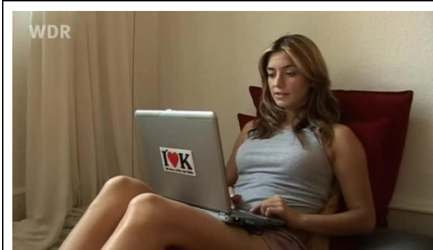
Julie tells her diary that she is getting really fond of Can.