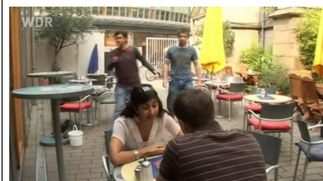
Can and Alex find Nina and Julie in a café.