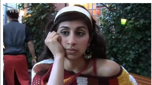
They are all very sad.