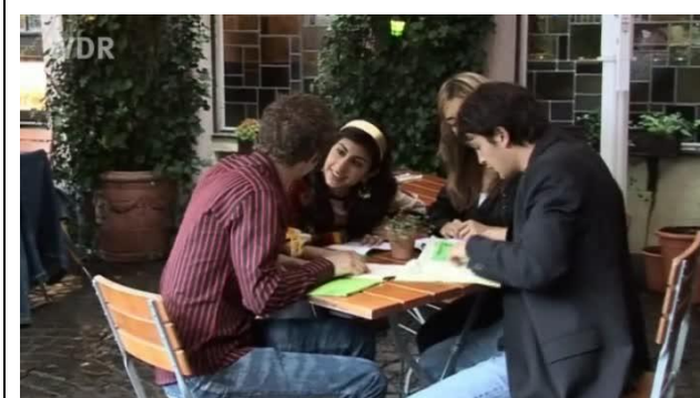
They have a goodbye dinner.