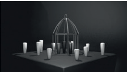
teacher – put non-white people at a table