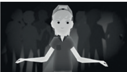
party – best friend – leave