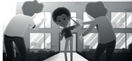
leave primary school – bullied