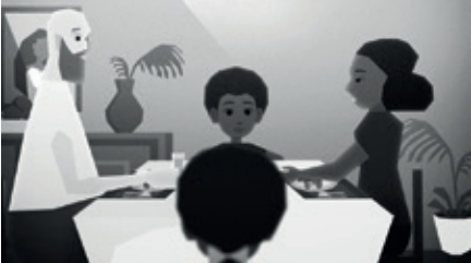
spent much time with mum – family