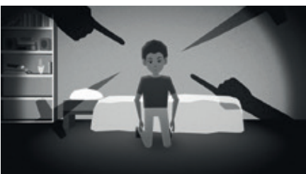
depression – suicidal thoughts