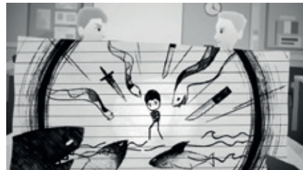
secondary school – wrote a note