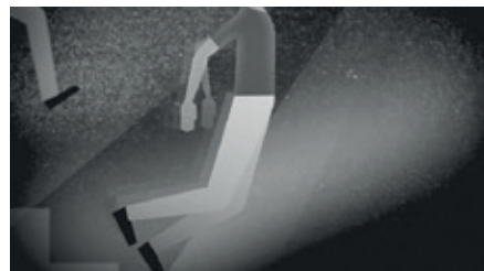
tried to kick – tried to spit on